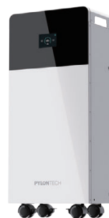
Fidus Battery Plus